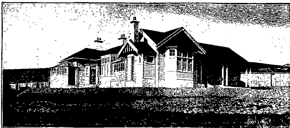
A PRETTY DUNEDIN HOME