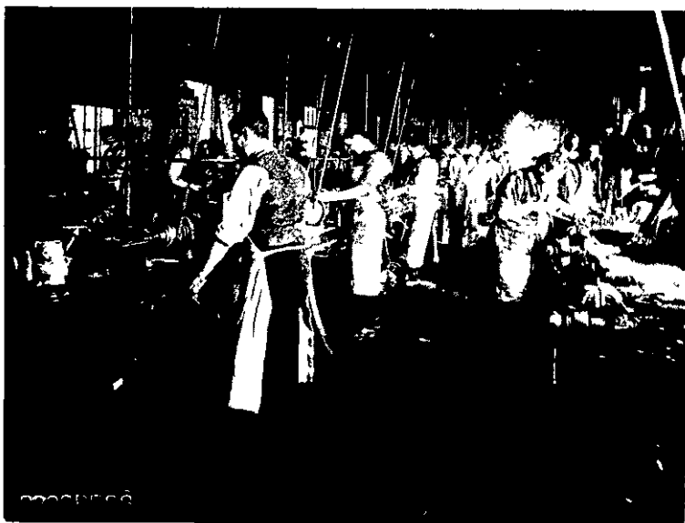
BRASS FINISHERS' DEPARTMENT.