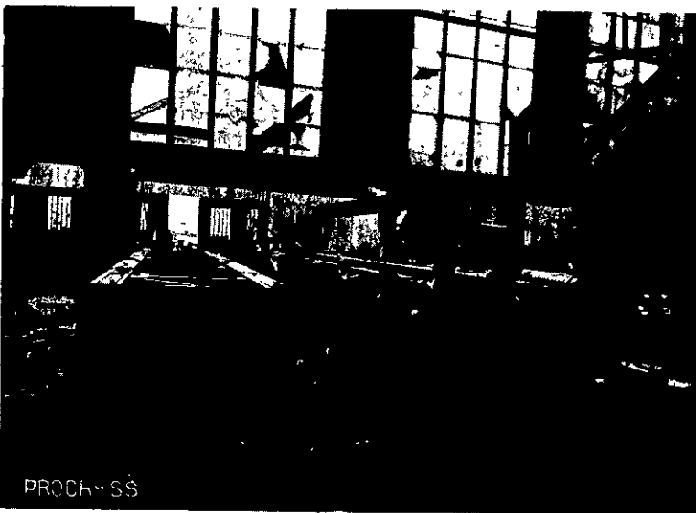
BRIDGE BUILDING YARD NO. 2 SHOWING MANUHERIKIA CROSSING NO. 3 BRIDGE UNDER CONSTRUCTION.