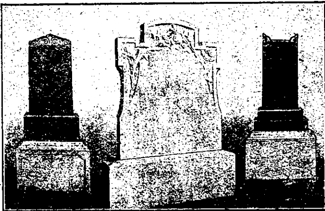
7-£11/10/- 8-£12/10/- 9-£12