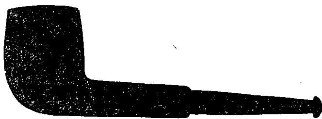
THE "SIMPLEX," 6/- EACH.

We have just landed a large shipment of the famous "L. & Co." Pipes, in Vulcanite and Amber Mouthpieces, From 3/6 to 12/6.