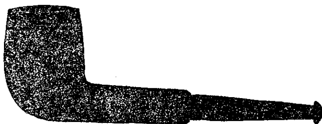
THE "SIMPLEX," 6/- EACH.

We have just landed a large shipment of the famous "L. & Co." Pipes, in Vulcanite and Amber Mouthpieces, From 3/6 to 12/6.