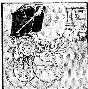
The Latest Hygienic Hood.