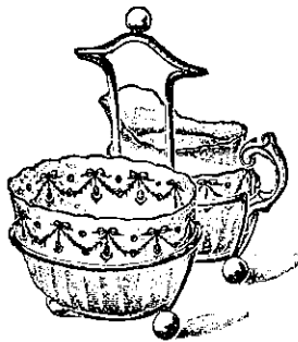
PRETTY SUGAR & CREAM, 20/-

In no part of the Silversmith's Trade is there such an element of doubt or such jugglery of words as in what is termed "Electro-plate". The outer appearance of a new article defies all judgment of its inner composition. We secure your confidence by selling reliable goods and giving honest value. We guarantee every sale and invite the closest comparison.