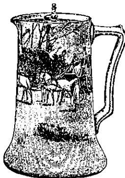
Doulton HOT WATER JUC, 15 6