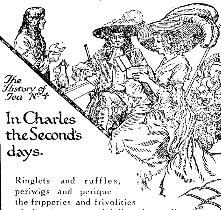
The History of Tea No. 4

BRADLEY BROS (CHRISTCHURCH) FOR STAINED GLASS