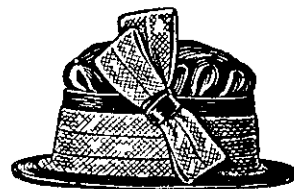
Small Sailor Shape, in black velvet, trimmed with white, 9/6 each.