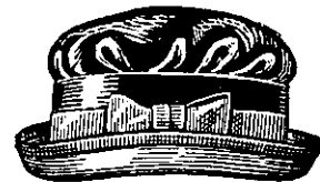
Fashionable Soft Shape, in black velvet, with white and coloured crown and lining, 6/11 each.