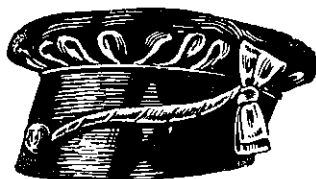
The "TIPPERARY" Hat. Made of Black Velvet, trimmed with black corded silk band, 13/11 each.