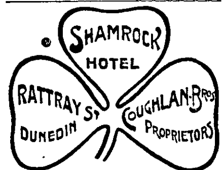
Table d'Hotel daily from 12 to 2, and Meals at all hours for travellers. Free Stabling.

The Wines and Spirits are all of the Choiceest and Best Brands. Dunedin XXXX Beer always on tap.