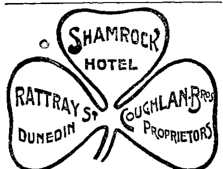
Table d'Hotel daily from 12 to 2, and Meals at all hours for travellers. Free Stabling.

The Wines and Spirits are all of the Choiceest and Best Brands. Dunedin XXXX Beer always on tap.