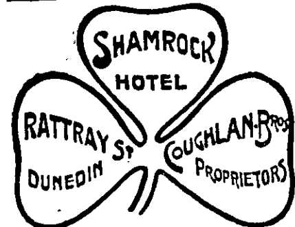
Table d'Hote daily from 12 to 2, and Meals at all hours for travellers. Free Stabling.

The Wines and Spirits are all of the Choicest and Best Brands. Dunedin XXXX Beer always on tap.