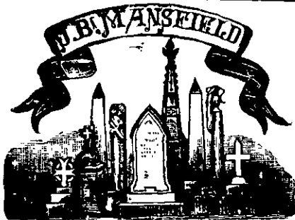
CHRISTCHURCH MONUMENTAL WORKS,

MANCHESTER AND BARBADOES STREETS, CHRISTCHURCH.