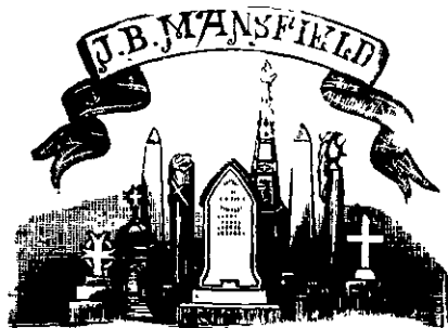
MANCHESTER STREET SOUTH, Near Railway Station, CHRISTCHURCH.