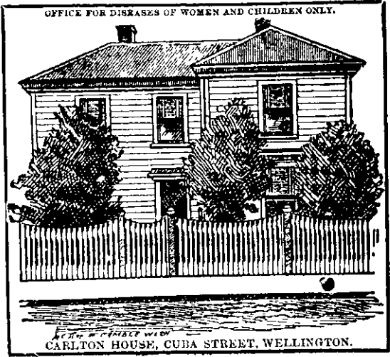
CARLTON HOUSE, CUBA STREET, WELLINGTON.

Patients at a distance treated by letter, no matter what their troubles may be.