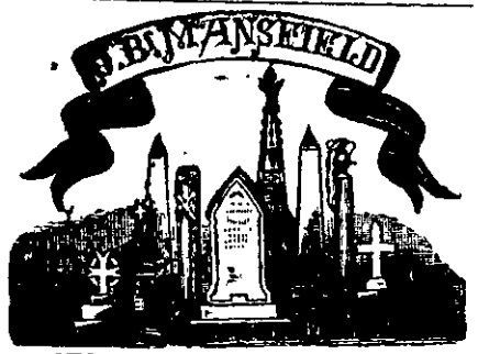
CHRISTCHURCH MONUMENTAL WORKS;

DRESSMAKING AND MILLINERY Done on the Premises.