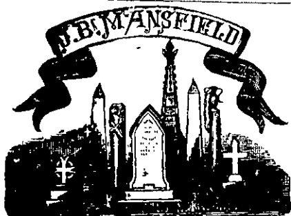
CHRISTCHURCH MONUMENTAL WORKS;

DRESSMAKING AND MILLINERY Done on the Premises.