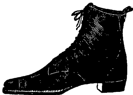
B O O T S