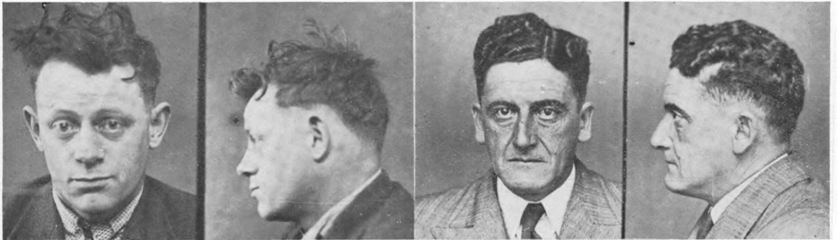
SMART, STANLEY, alias AL CAPONE.

F.P. Class \frac{17}{11} \frac{IO}{I} \frac{15}{9}