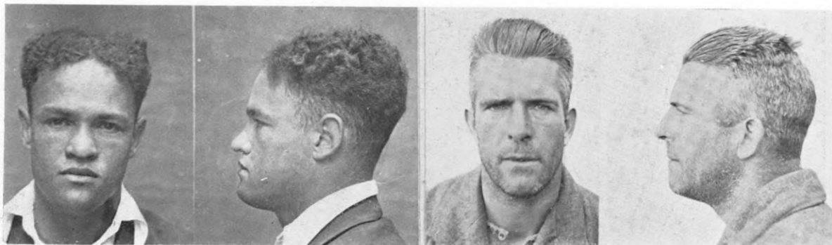
HASSETT, WILLIAM WALTER.