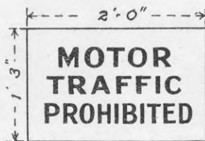
Black lettering on a white ground.