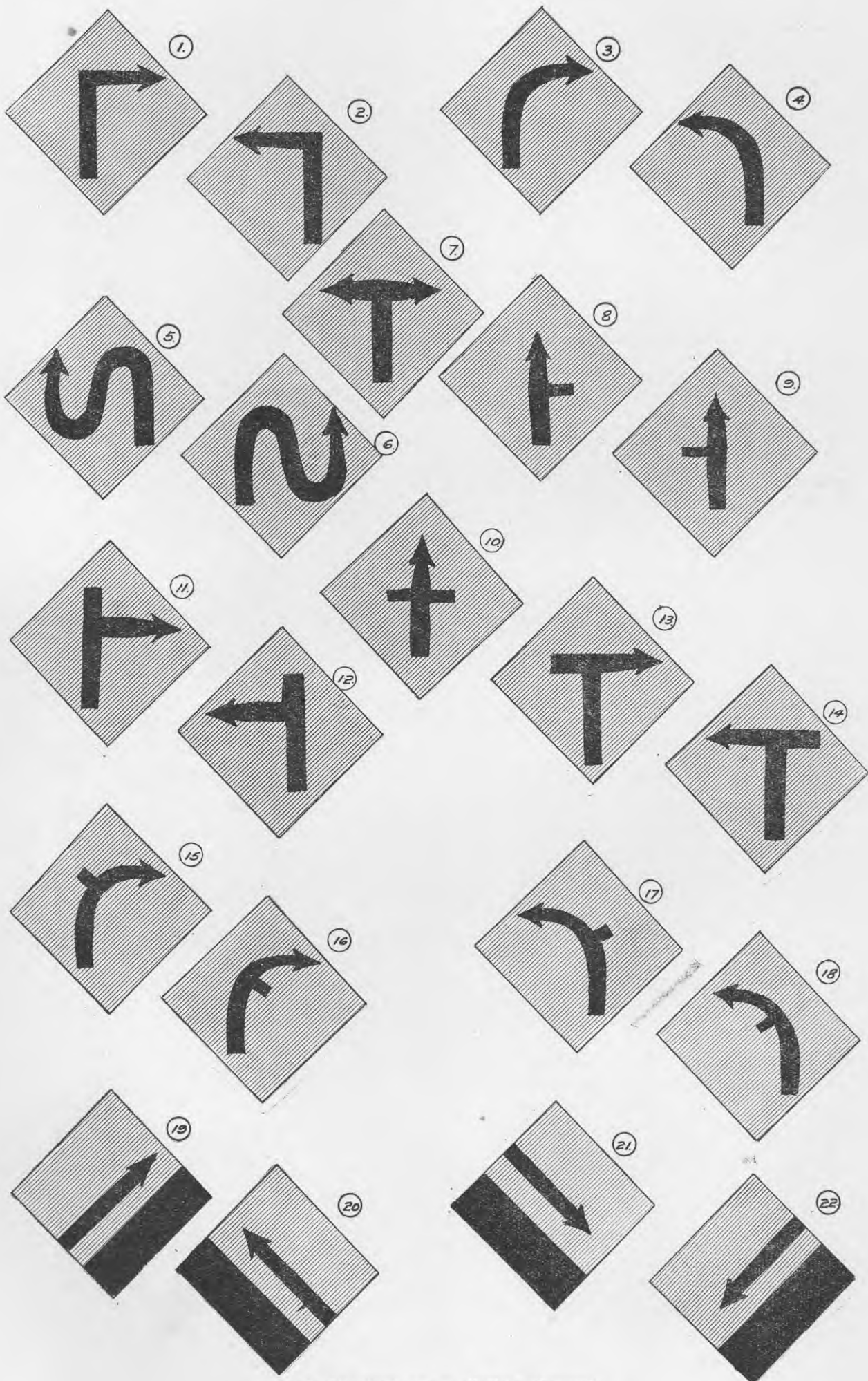
Black Symbols on a Yellow Ground.