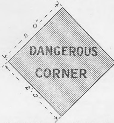
Black lettering on a yellow ground.