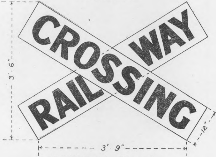
Black lettering on a white ground.