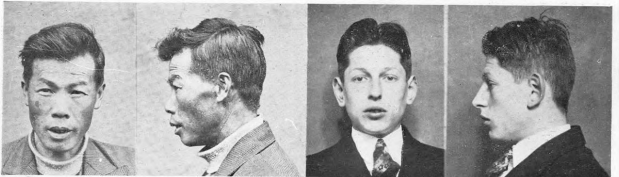
MANN YOUNG YORK.

F.P. Class \frac{13}{1} \frac{U}{U} \frac{OO}{OO} \frac{24}{18}