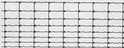
Standard Boundary Fence. 36" high, 12" between stay wires.