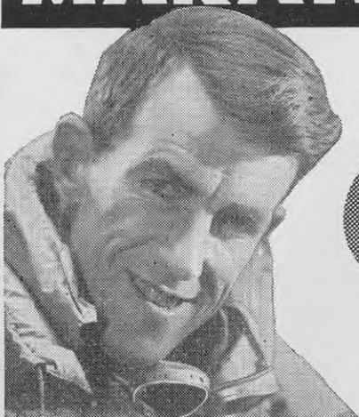
SIR EDMUND HILLARY

The Most Durable and Hardest Wearing Gumboots You can Buy!!