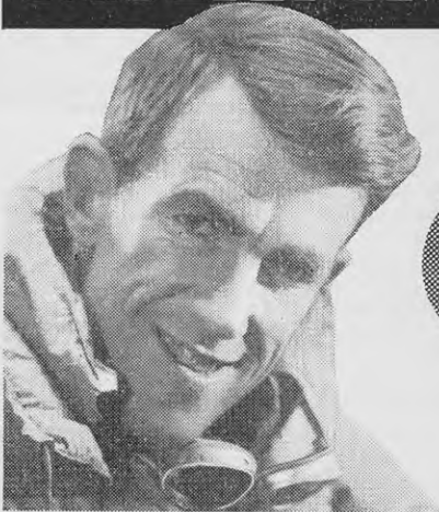
SIR EDMUND HILLARY

The Most Durable and Hardest Wearing Gumboots You can Buy!!