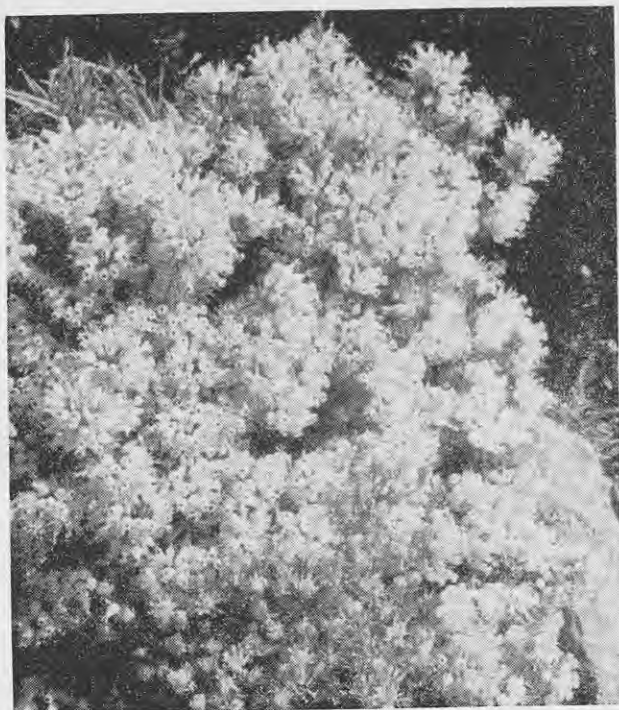
Erica ventricosa has swollen tubular flowers during spring and summer.

▼ Erica oatesi , usually called Erica "Winter Gem", is one of the brightest dwarf winter-flowering plants.