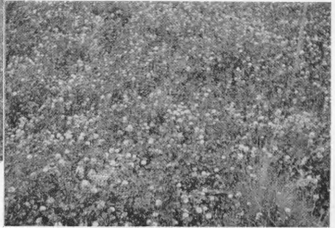
Right—Clovers established by subsurface drilling with grassland tips and with fertiliser and lime.