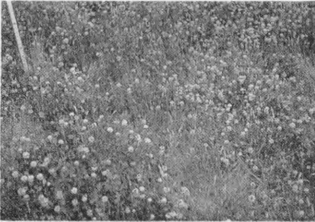
Method of seeding (pitchpoled section): Surface broadcast.