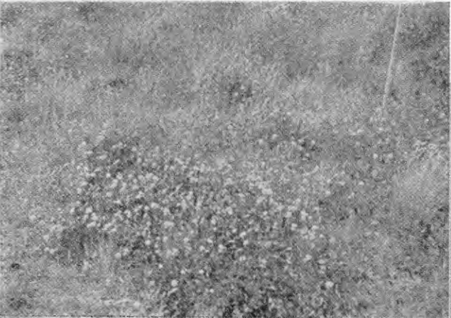
▲ Fertiliser treatment (drilled section): Superphosphate alone. Fertiliser treatment (drilled section): Superphosphate plus → lime.