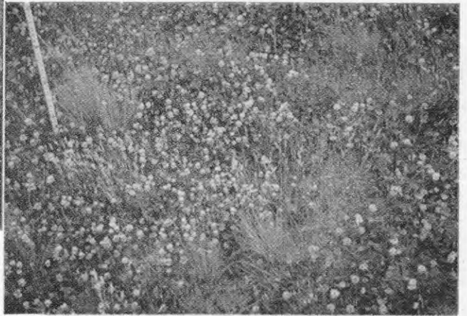
Method of seeding (broadcast section): Seed and fertiliser oversown on undisturbed surface.