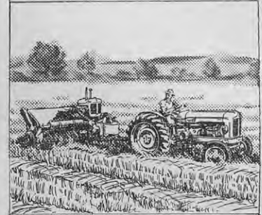
HARVESTING: Takes back- breaking work out of harvesting. Gets crops in faster.