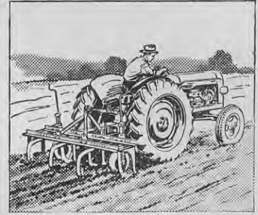
CULTIVATING: Mounted implements plus the powerful "Major" make a perfect seed bed.

Choice of 3 engines (petrol, diesel, and kerosene); powerful hydraulics; six forward and two reverse speeds.