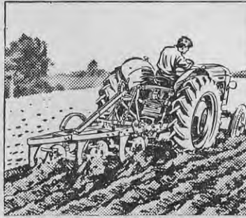
PLOUGHING: Makes easy work of ploughing and discing even in heavy soil.

Special additional equipment available at low cost. Delivered any Dealer Town—convenient terms avail- able. Prices and specifications subject to change without notice.