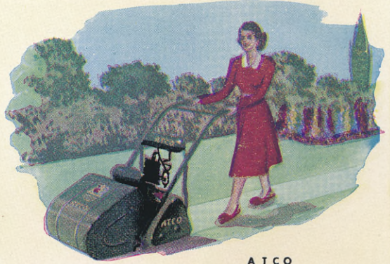
ATCO MOTOR MOWERS England's Finest Power Mower 14", 17", 20", 28" and 34" widths.

Quickly changed into an all-purpose garden tractor for ploughing, cultivating, etc.