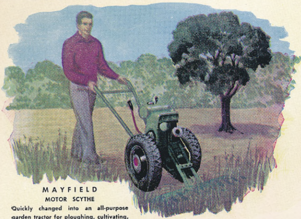
MAYFIELD MOTOR SCYTHE

Quickly changed into an all-purpose garden tractor for ploughing, cultivating, etc.