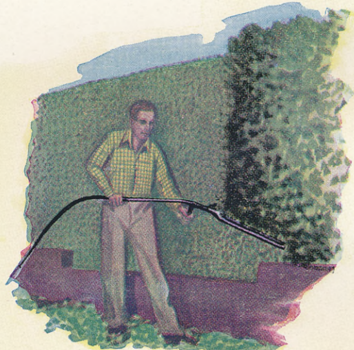
SHEAROMATIC HEDGE CUTTER

With compressor and sprayer unit, sickle mower and attachments for cultivating, etc.