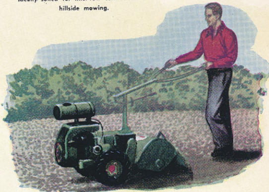
MONROTILLER ROTARY CULTIVATOR

With compressor and sprayer unit, sickle mower and attachments for cultivating, etc.