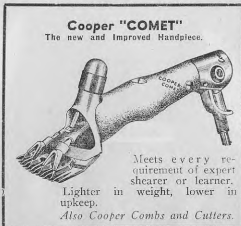
Cooper "COMET" The new and Improved Handpiece.

Meets every requirement of expert shearer or learner. Lighter in weight, lower in upkeep. Also Cooper Combs and Cutters.