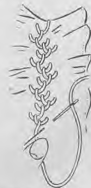
Fig. 9—The double feather stitching at the sleeve hem.

Turn up the hem 2\frac{1}{2} in. and hand stitch it to make the hem easier to unpick when it is necessary to lengthen the frock.