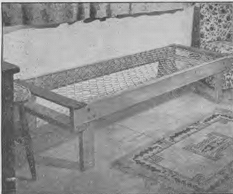
The framework of the seat.

Materials for the cover will be found in the soft furnishing lines: Cotton tapestry, cretonne, linen, and chintz are all suitable, though velvet types and richer materials would make a more sumptuous article. Haircords, casement cloth, cotton prints, and gingham make serviceable, easily-laundered, and less expensive coverings which are quite in keeping with the usual interior decorations of sunporch, bedroom, or kitchen-living room.