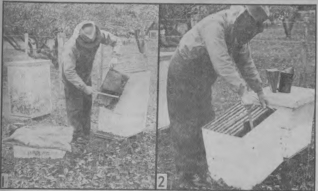
Left—A slow and unsatisfactory method of brushing bees off combs. Right—A super placed on an empty box with one frame removed for brushing.