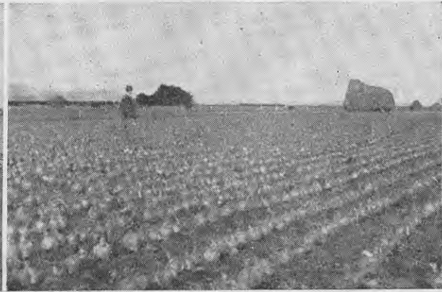
Left—Typical dairy farmers' ewes on good crop of chou moellier divided into breaks by few turnip drills. Right—Good crop of swedes near Edendale after tops have been eaten off by lambs.