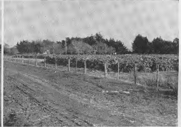
Left—View showing layout of farm. In foreground a hard-grazed run-off paddock for cows coming off chou moellier. Right—Chou moellier grown with rationed fertiliser.