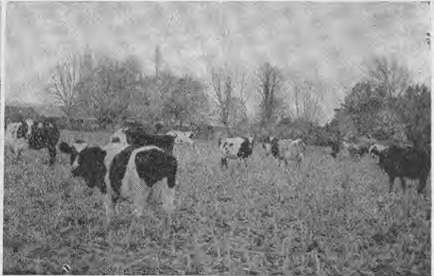
Left—Application of lime has been the keystone to Southland's development. Right—Portion of the dairy herd.