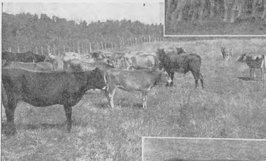
Left.—Young stock reared successfully on one-time very bush-sick country.