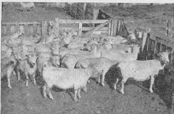
Left.—Four-year-old ewes on same farm as shown in photo below. These ewes had been given a limonite-salt lick for seven months and remained perfectly healthy.