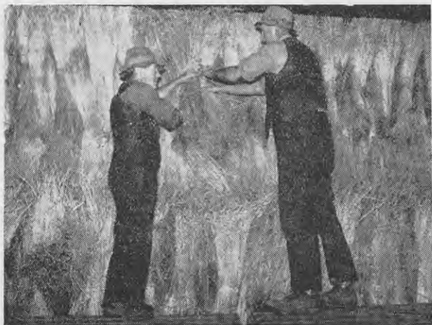
Retting tanks are filled with straw.