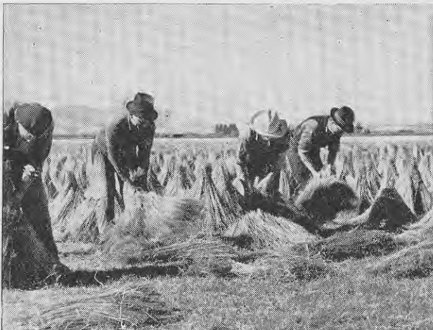
The straw is gaited in the field for drying.