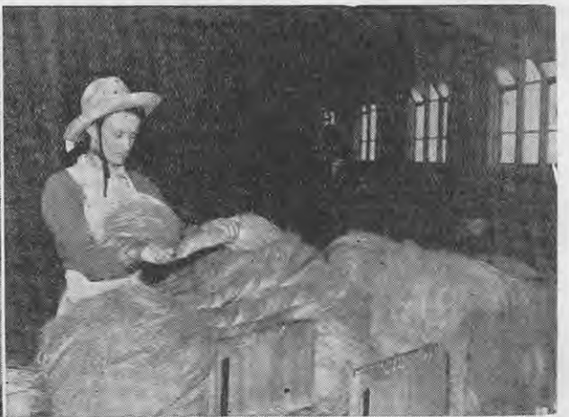
The flax is put up into "hands" ready to be baled for export to Great Britain.