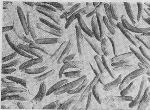
Grade 1.—Clean, unbroken, dry ergot, 8/- per lb., or 6d. per oz.

The mixed ergot and grass seed so obtained from the cut or stripped heads should then be winnowed to remove, as much as possible, all the foreign matter and to obtain as pure a sample of ergot as possible. In winnowing, as in all operations, care