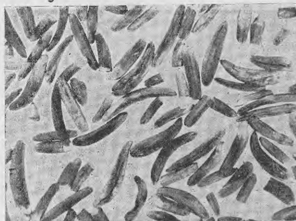
Grade 2.—Clean dry ergot but with some broken grains, 6/8 per lb., or 5d. per oz.