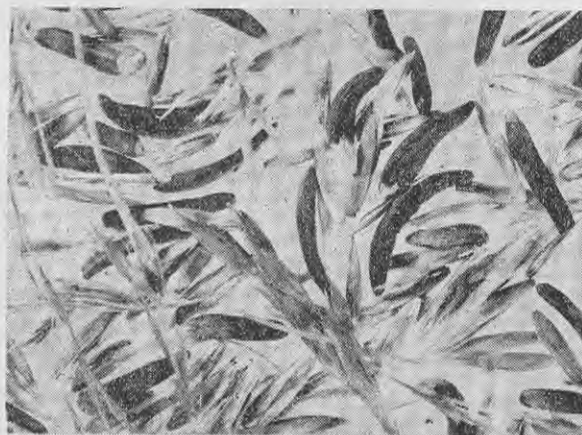
Grade 3.—Unbroken, dry ergot mixed with chaff, etc., 5/4 per lb., or 4d. per oz.