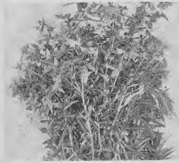
Fig. 2.—Showing both types of leaves.

When ripe, the pods are of a blackish-brown colour. The pods fall to the ground and open, releasing the seeds. When the young seedlings first