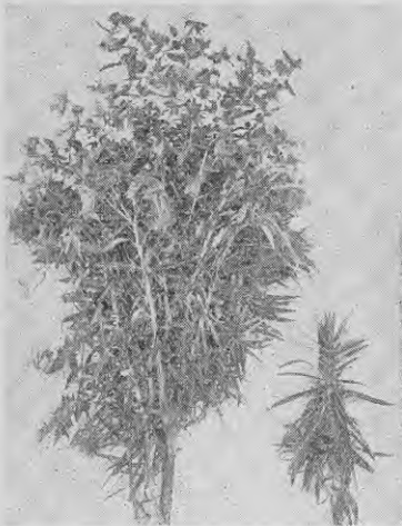
Fig. 1.—A young plant and one fully grown.

The accompanying illustrations show the plant in two stages:—(1) A young plant and one fully grown; (2) showing both types of leaves; and (3) a young plant and the top of a matured plant. Seed pods can be seen along the stems.