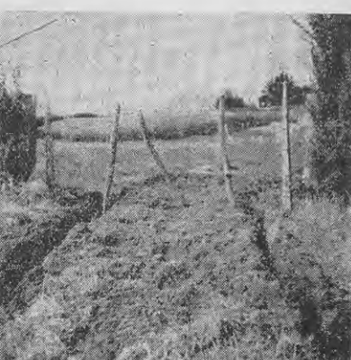
That wire gate, probably erected temporarily, becomes a permanent fixture, resulting in loss of time and temper, and soon deteriorates beyond efficient use.