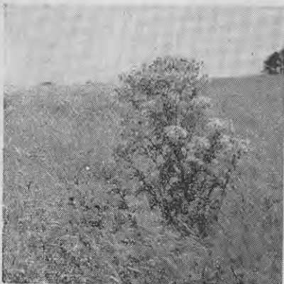
That lone ragwort plant, in full bloom, will soon produce enough seed to infest the whole paddock. Remove it in a sack, burn it, and save yourself future work.