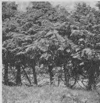
That Lawsoniana hedge, through lack of double fencing, is damaged by stock, and its value as a windbreak and shelter belt is lost.