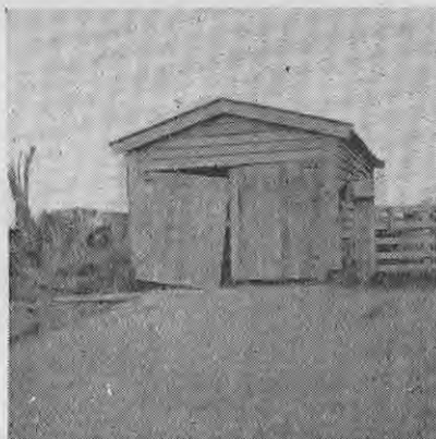
That broken hinge will soon allow this door to fall and probably get broken, resulting in a high replacement cost and damage to the contents of the shed.