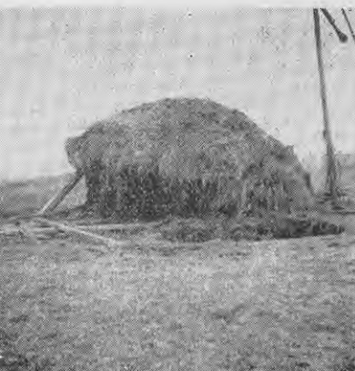
That wasted effort. In a few months this ensilage stack will be reduced to a manure heap, fit only to refill the hole dug to procure the weight for the stack.