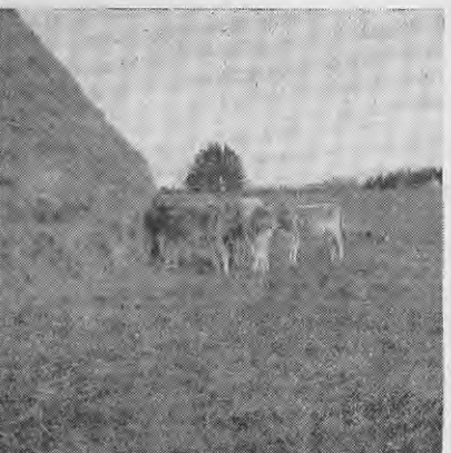
That unfenced haystack, to which stock have access, is being wasted, and this limits the amount of feed available for the winter.