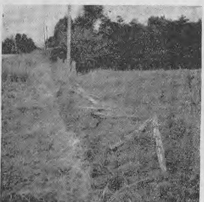
That broken fence which allows stock to wander may result in dairy cows becoming a complete loss from torn teats and udders, and causes much loss of time.