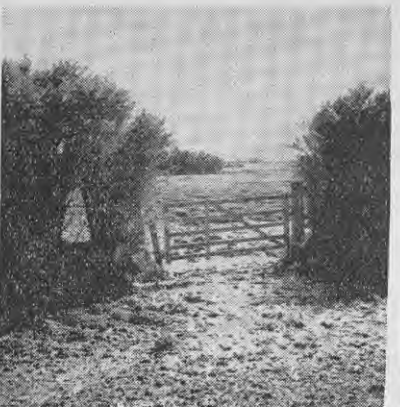
That muddy gateway, through which the herd is driven daily, results in chills to the udder, and is a predisposing cause of mastitis. Fill it up in dry weather and stop this loss.