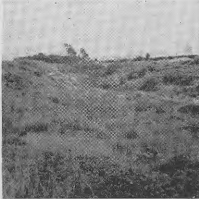
That dirty gully infested with blackberry, ragwort and fern can be turned into a valuable asset by planting it with trees to provide shelter, posts and firewood.