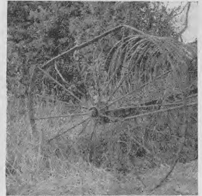
That farm implement left under the hedge from one season to the next soon depreciates, and, when wanted, is not in a workable condition. Keep it in a shed.