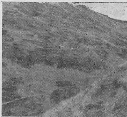
Fig. 2.—Block 3 after treatment with the flame-thrower.