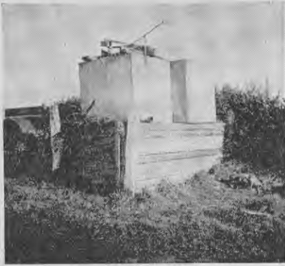
The distributing tanks are left on this loading bank when not in use.