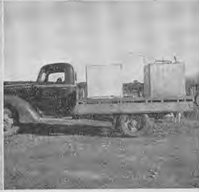
The farm truck picks up the tanks for filling at the sump.