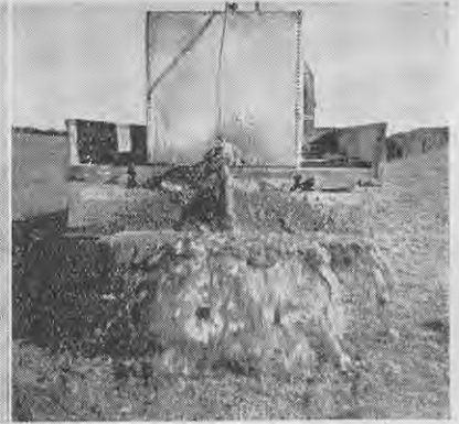
The liquid manure is applied at 16 to 18 tons per acre. The 400-gallon tank is emptied in about four minutes.

distribute, but the more concentrated should be the application.