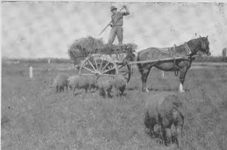
Feeding green lucerne to light baconers in the mid-summer dry period.

The results obtained on two farms co-operating with the Canterbury Agricultural College Advisory Service show the advantages of pig raising on Canterbury farms. The first is an illustration of the annual income obtained from pigs. The second indicates what can be done with unsale-