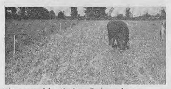
but for successful rationing-off of saved grass