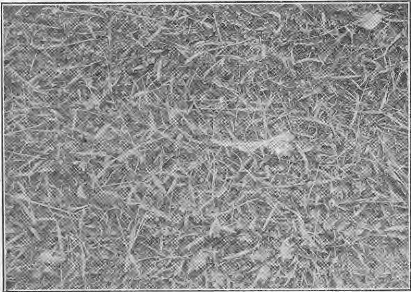
FIG. 7. PASTURE-SWARD COMMONLY SEEN ON PODSOLIZED TE KOPURU SAND.

Stunted paspalum, Lotus hispidus , sweet vernal, suckling clover, and catsear. Note sweet vernal in flower. Photo taken 18/10/35.