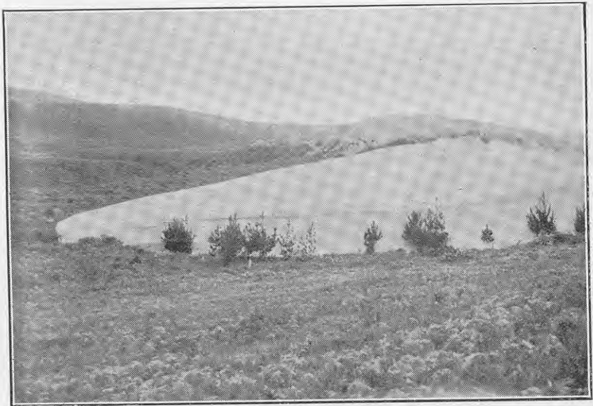
FIG 2. BARE SAND-DRIFT INVADING THE ROLLING COUNTRY OF THE OLDER FIXED DUNES.

The foreground, the typical vegetation supported by the sand.