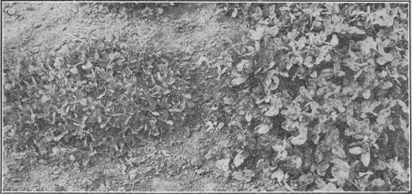
FIG. 6. THE STUNTING EFFECT OF PEA-MOSAIC ON RED CLOVER. HEALTHY PLANT ON RIGHT.

Both field and glasshouse experiments indicate that Lord Chancellor and Little Marvel peas are either immune or highly resistant to pea-mosaic. Observations made in the field both at Palmerston North and