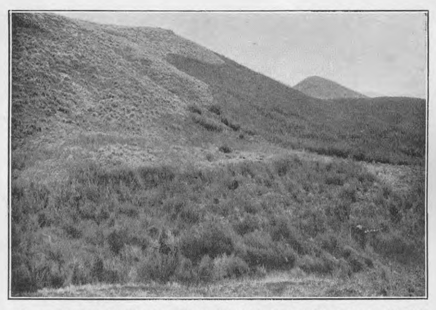
FIG. 5: HILLSIDE IN NATURAL STATE, SHOWING AREA BURNT SOME YEARS AGO WHICH HAS REVERTED TO TUSSOCK. NGAKURU BLOCK.

Clearing costs can be considerably reduced if the manuka and manoao scrub are burnt standing two or three years ahead of cultivation.