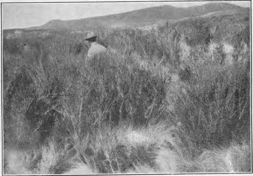
FIG. 3. AN UNDEVELOPED TUSSOCK AND MANOAO FLAT. NGAKURU BLOCK, ROTORUA DISTRICT.